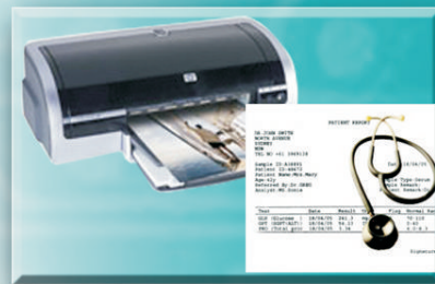
Direct Patient Result Reporting

1 Specifications are subject to change without prior notice. Accessories shown are not part of the standard accessories