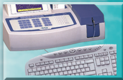
PC Keyboard Interface