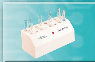
16 Position Dry Block Incubator