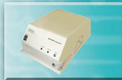
Battery Backup Unit